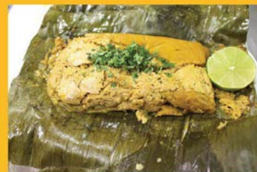
BOLLO DE PESCADO (Mashed green plantain w/fish served in leaf plantain) $ 8.00