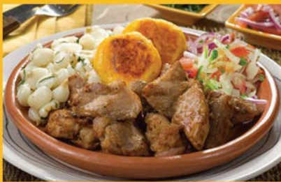
FRITADA (Fried pork)