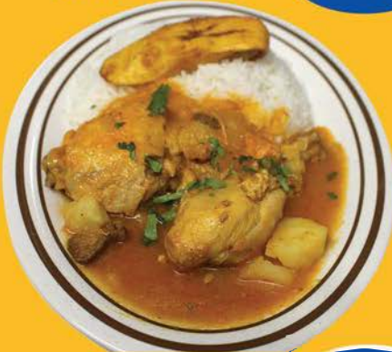
SECO DE POLLO (Chicken stew)