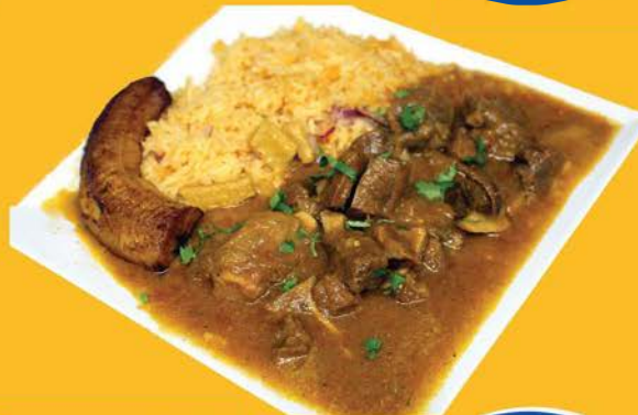
SECO DE CHIVO (Goat stew)