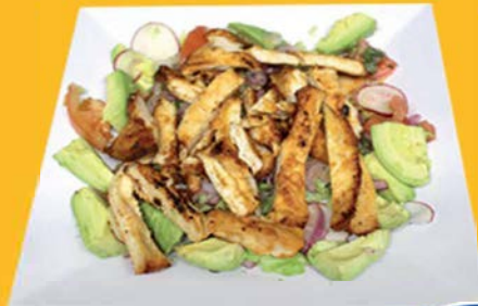
ENSALADA DE POLLO (Chicken salad)