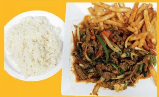
LOMO SALTEADO (Sauteed beef with french fries)