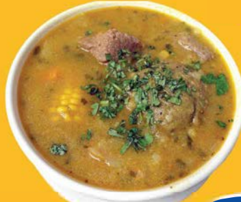
CALDO DE BOLA (Beef, Green plantain ball Soup)