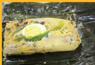
AYACAS (Sweet cornmeal cake with chicken)