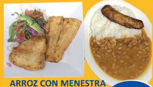
ARROZ CON MENESTRA Y PESCADO (Rice, beans and filet fish)