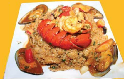
ARROZ MARINERO (Seafood Rice) $ 23,00