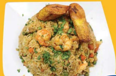
ARROZ CON CAMARONES (Rice with Shrimps) $ 16,00