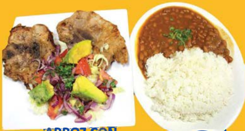
ARROZ CON MENESTRA Y CHULETAS (Rice, beans and pork chops)