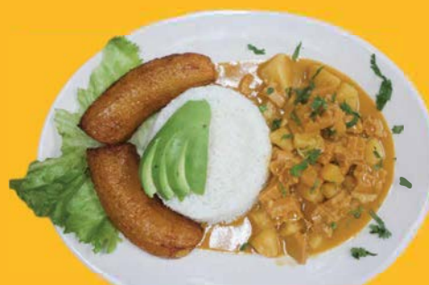
GUATITA (Tripe stew)