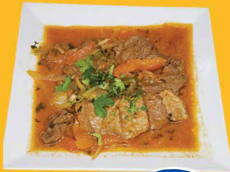
Bistec de Carne con patacon Beef Steak with Onions and green plantains