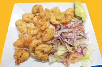
CAMARONES APANADOS (Breaded Shrimps) $ 18,00