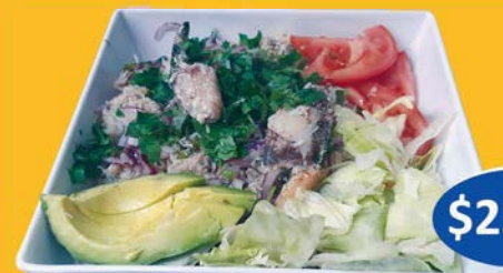
ENSALADA DE LECHUGA Y TOMATE (Lettuce, tomato and onions salad)