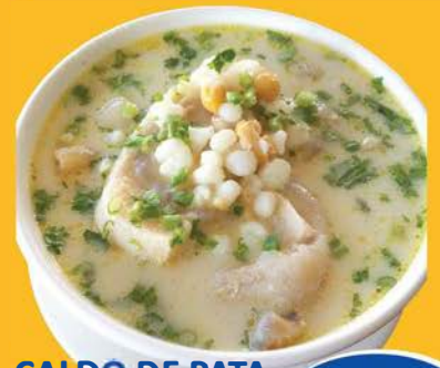
CALDO DE PATA (Cow feet Soup)