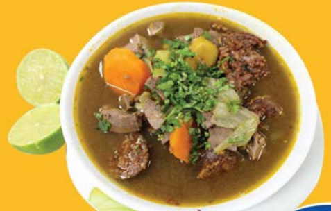
CALDO DE SALCHICHA (Sausage Soup)