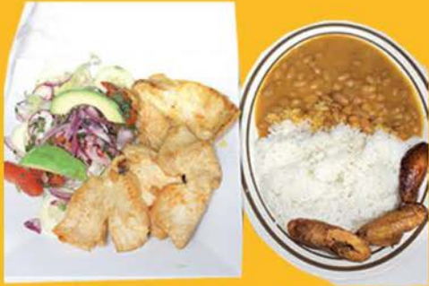
ARROZ CON MENESTRA Y POLLO (Rice, beans and chicken)