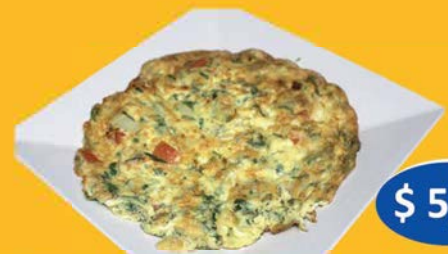
TORTILLA DE HUEVO CON VEGETALES (Omelet, tomato, onion & green pepper)