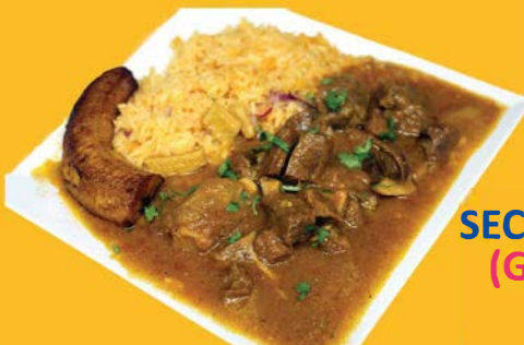
SECO DE CHIVO (Goat stew)