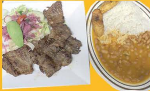
ARROZ CON MENESTRA Y CARNE (Rice, beans & fried beef)