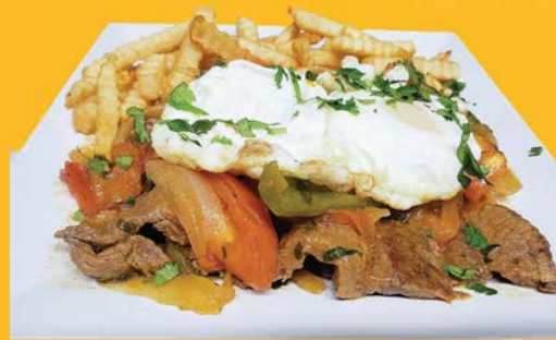
CHURRASCO Beef Steak with french fries and Fried egg