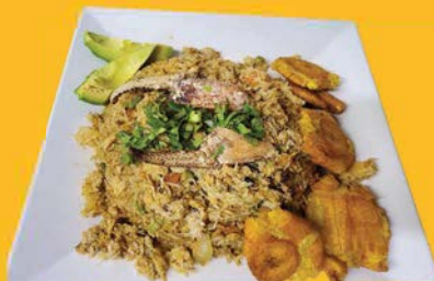
ARROZ CON CANGREJO (Rice with Crab Meat) $ 23,00