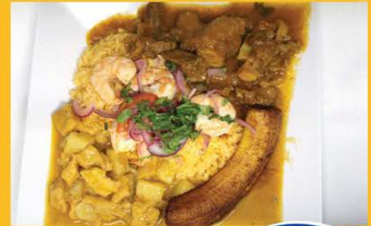
BANDERA (Ecuadorian flag)