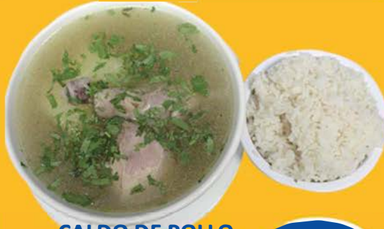
CALDO DE POLLO (Chicken Soup)