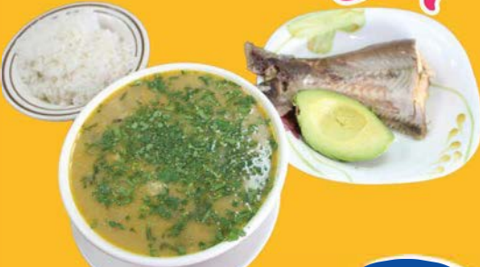
CALDO DE BAGRE (Catfish Soup)