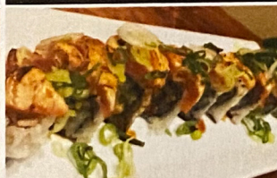
17. Lion King Maki Spicy crab salad, cucumber, topped with torched salmon, eel sauce, scallions 11.25