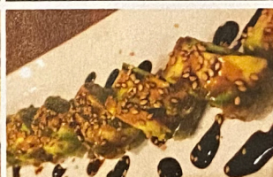
13. Caterpillar Maki Eel, cucumber, topped with sliced avocado, eel sauce 10.50