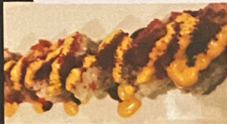
1. Crazy Maki Shrimp tempura, avocado, cucumber, tobiko, spicy mayo, eel sauce 9.75