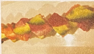
7. Rainbow Maki Crabstick, avocado, cucumber, white fish, salmon, tuna, avocado 12.25