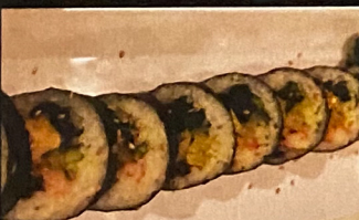
21. Futo Maki Tamago, Spinach, cucumber, pickled radish, crab stick, burdock 11.25