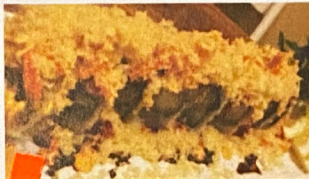
8. Crunch Special Maki Shrimp tempura, avocado, cucumber, tobiko, spicy mayo, crushed tempura, eel sauce 10.50