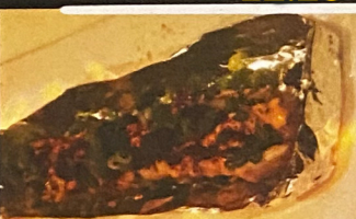
11. Fire Bruins Maki Shrimp tempura, avocado, scallion, cucumber, topped with torched yellowtail, eel sauce, tobiko 14.75