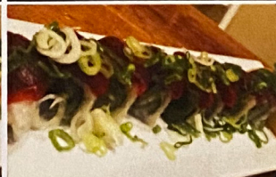
18. Tuna Scallion Tuna, scallions, on top with tuna 12.25