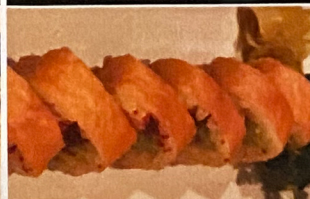
22. Pink Lady Maki Salmon, avocado, mango, cream cheese, tobiko, wrapped with soybean paper 13.50