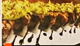
10. Celtics Maki Shrimp tempura, avocado, cucumber, topped with torched salmon, avocado sauce, eel sauce 13.50