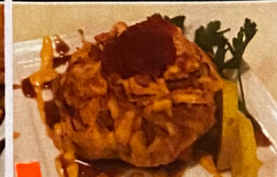
24. Crunch Salmon Ball Avocado, crunch, tobiko, mayo, crab, outside with torched salmon 11.25