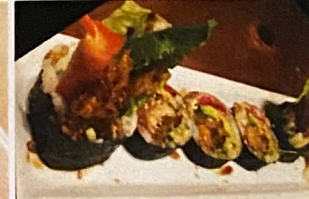
25. Spider Maki Fried soft shell crabs, mayo, tobiko, avocado, crab sticks, cucumber, lettuce, eel sauce 11.25

*Please notify your server of any food allergies before ordering.