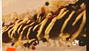
5. Playboy Maki Shrimp tempura, avocado, cucumber, topped with tuna, crushed tempura and tobiko, mayo, eel sauce 13.75