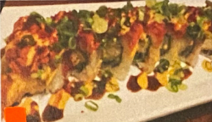
3. Red Dragon Maki Shrimp tempura, avocado, cucumber, topped with spicy tuna, tobiko, scallions, spicy mayo, eel sauce 13.25