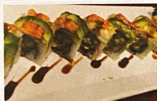
14. Scorpion Maki Eel, cucumber, topped with shrimp, avocado 11.25