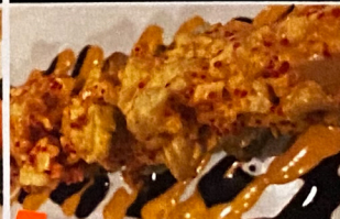
23. Baked Spicy Scallop Maki Shrimp tempura maki topped with spicy scallop, crab, tobiko, crunch 13.50