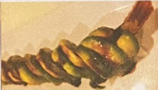
2. Dragon Maki Shrimp tempura, avocado, cucumber, topped with sliced avocado, eel sauce 12.25