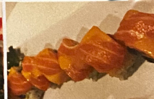
20. Salmon Mango Harmony Salmon, Mango, topped with salmon & mango 12.75