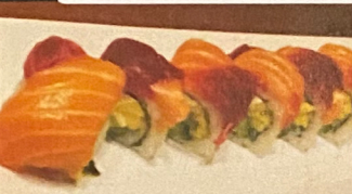
6. Frenchkiss Maki Cream cheese, avocado, mango, topped with tuna and salmon 12.25