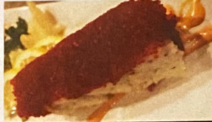
9. Red Sox Maki Tuna, avocado, topped with tobiko 13.75