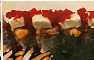
19. Oppa Maki Spicy crab salad and cucumber topped with torched salmon, cream cheese, tobiko, eel sauce and spicy mayo 12.50