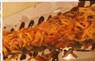
15. Tornado Maki Shrimp tempura, avocado, cucumber, topped with spicy crab sticks, tobiko, eel sauce, spicy mayo 10.50