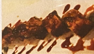
4. Black Dragon Shrimp tempura, avocado, cucumber, eel sauce, topped with torched eel 13.95