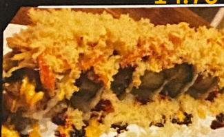
16. Super Crunch Maki Shrimp tempura, crunch, avocado, cucumber, spicy crabstick, eel sauce, tobiko 11.25