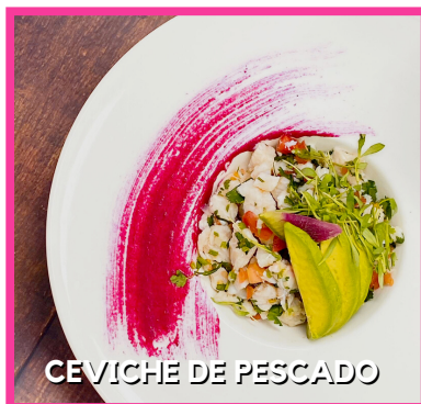
CEVICHE DE PESCADO

CEVICHE DE PESCADO $12 FISH MARINATED IN LIME JUICE, DICED ONION, TOMATO, & CILANTRO