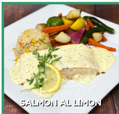
SALMON AL LIMON