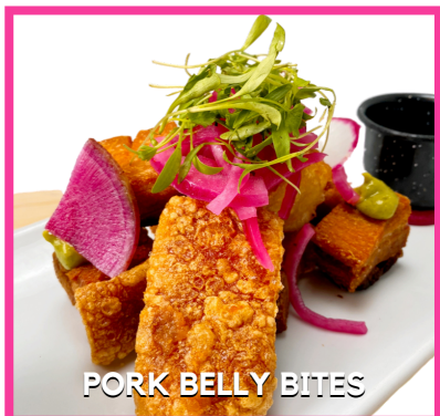
PORK BELLY BITES

DIABLA, MARTAJADA, HABANERO, MACHA DE CHILE QUEBRADO, BALSAMICO, MOLE COLORADITO, MOLE OAXAQUEÑO, OR POBLANO