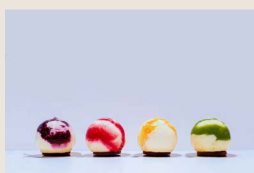
Patisserie G, Millenia Walk