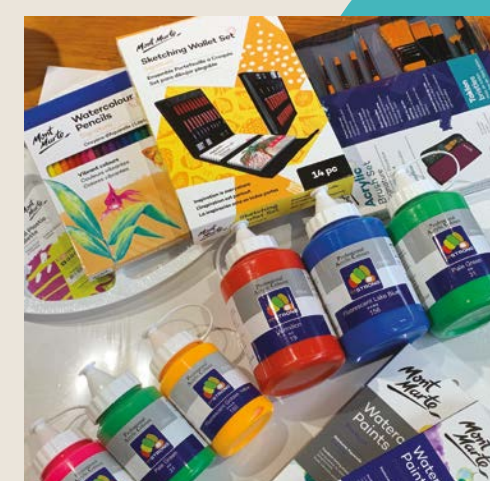
Umistrong Art Hub, Suntec City