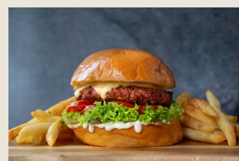
Harry's, South Beach