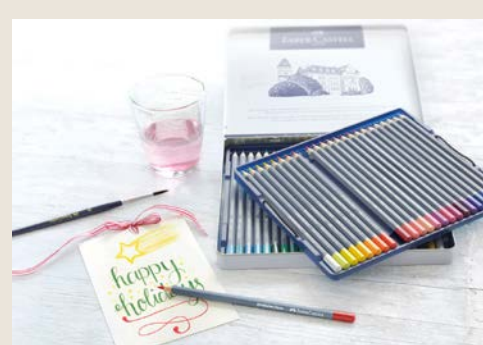
Faber-Castell, Marina Square