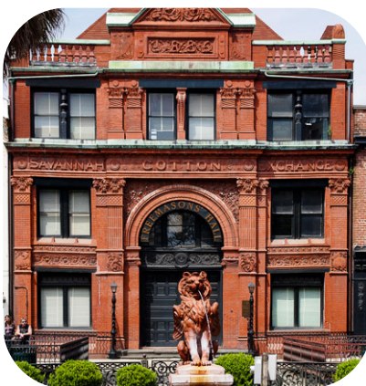
Cotton Exchange Building