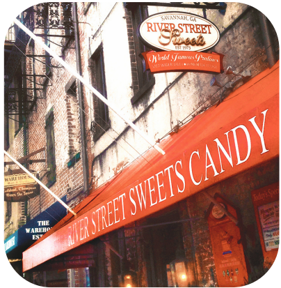
River Street Sweets