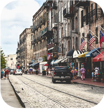
Downtown River Street