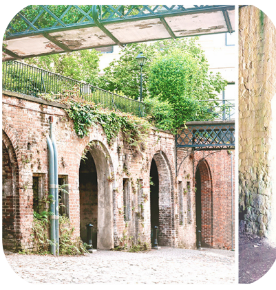
The Clunky Vaults