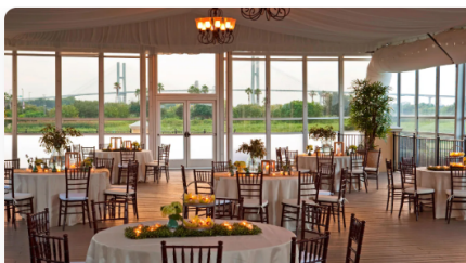
The Champions Bar & Grill American

Dine on Savannah favorites or lighter fare and sip a classic cocktail while overlooking the fairways in the relaxed atmosphere of The Champions Grill & Legends Bar. Currently closed while golf course is being refreshed.