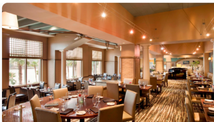
Aqua Star Coastal Southern

Experience our signature restaurant, serving Southern Coastal delights for breakfast, lunch, and dinner. Hours are subject to change seasonally.