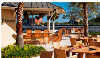
Escape Pool Bar & Grill American

🕒 Mon-Fri 6:30 AM-12:00 PM Sat-Sun 6:30 AM-1:00 PM