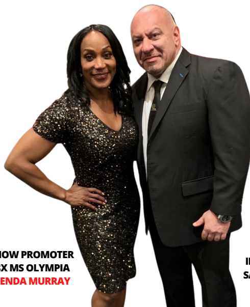
SHOW PROMOTER 8X MS OLYMPIA LENDA MURRAY