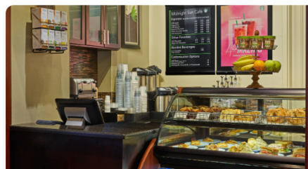
Starbucks Cafe at Midnight Sun Coffee House

Fuel your day in Savannah with your favorite Starbucks® coffee drink or delicious pastry at this bright and cheerful café, which also serves fruit and to-go snacks.