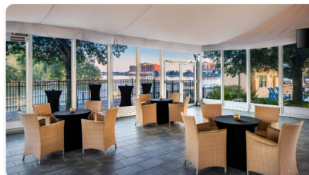
Midnight Sun Lounge American

🕒 Everyday 7:00 AM-11:00 AM 12:00 PM-3:00 PM 5:00 PM-10:00 PM